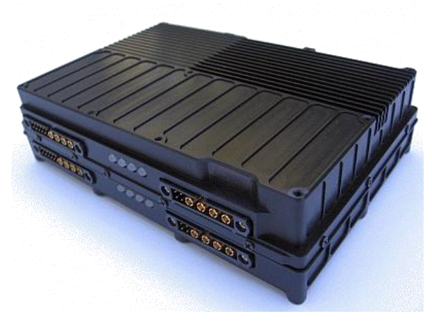
Figure 1 – 250W PMU

The 250W PMU simplifies UAV power distribution by providing multiple power outputs, which are individually programmable for voltage as well as being battery-backed. Dual (redundant) battery support is also included as standard.